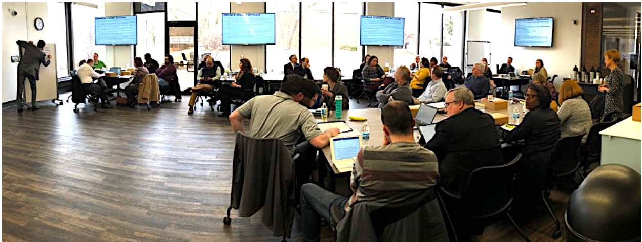
Planning Team members discussing their preliminary objectives; March 13, 2019.

In the second phase, each Planning Team developed objectives to support their aspiration. Objectives are the expected results and detailed achievements to support our aspirations; they are how we define success in accomplishing our strategic plan. Each Planning Team submitted a preliminary draft of their objectives on March 11. On March 13, the Teams presented their work to date at an open forum and met with each other to gather feedback and take a holistic look at how the strategic plan was coming together. The high-level strategy and preliminary objectives were also shared with the university's Community Engagement Board for their feedback. Community support is going to be essential to successfully implementing all aspects of our strategic plan and this was an important opportunity to get input from a group of dedicated community supporters.