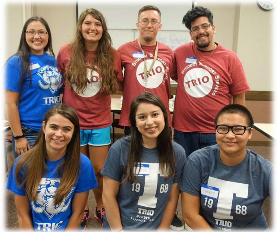
2016-2017 TRIO Peer Mentors

Mentors meet once a month as a group with mentees for lunch and fun! Mentors lead the group