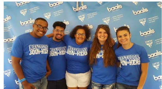
TRIO Club members volunteer at the Baals Music Festival