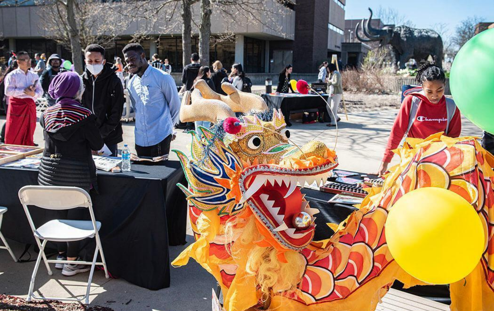
The Asian Heritage Festival was held in Alumni Plaza on Wednesday. Many customs and countries were represented. The festival was sponsored by the Office of Diversity, Equity, and Inclusion.