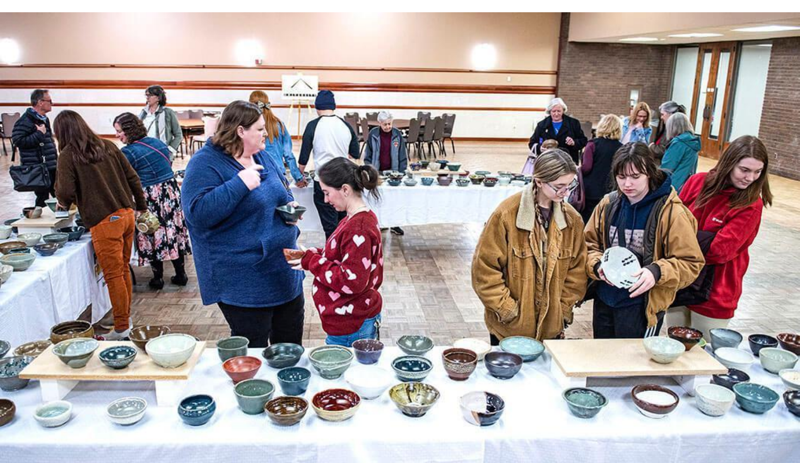
The Department of Art and Design sponsored its Sixth Annual Empty Bowls Fundraiser in the Walb Student Union International Ballroom on Tuesday. Individuals who donated $35 received a handcrafted bowl and complimentary grab n' go soup lunch, as

Seen and noted around campus. Monitor our university social feeds for more great moments of Mastodon life.