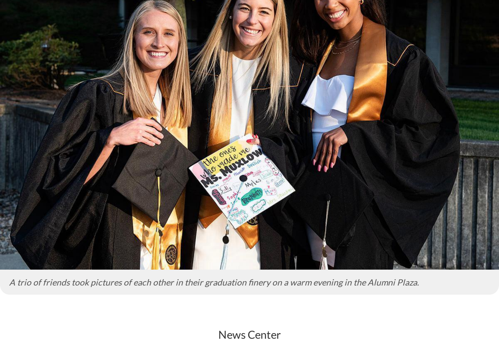
A trio of friends took pictures of each other in their graduation finery on a warm evening in the Alumni Plaza.

Seen and noted around campus. Monitor our university social feeds for more great moments of Mastodon life.