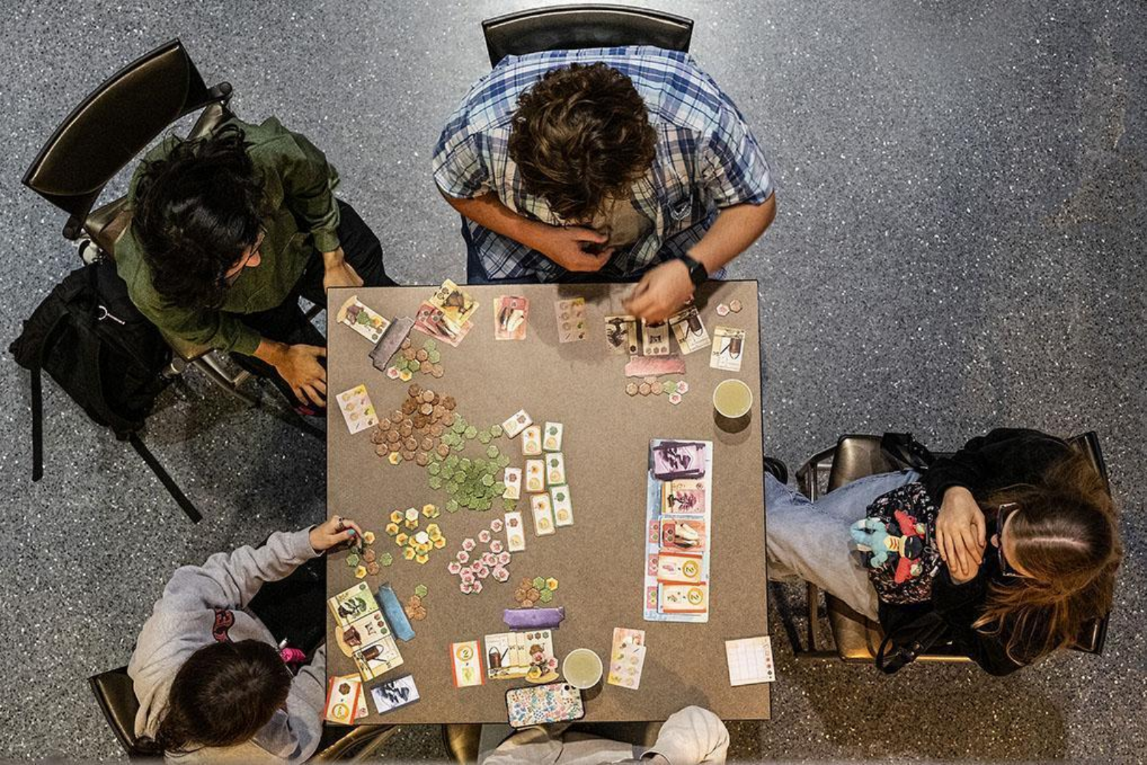
Numerous board game players gathered in the Walb Student Union atrium on Friday for one of the monthly Spielfreaks campus/community board game nights.