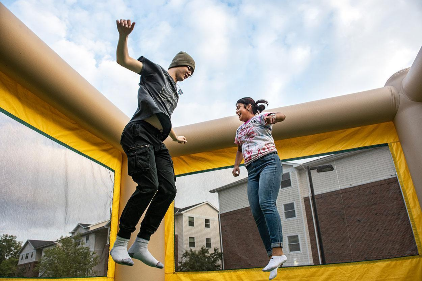
Students enjoyed pizza, yard games, and a fun bounce house at student housing's Bounce Back event on Thursday.