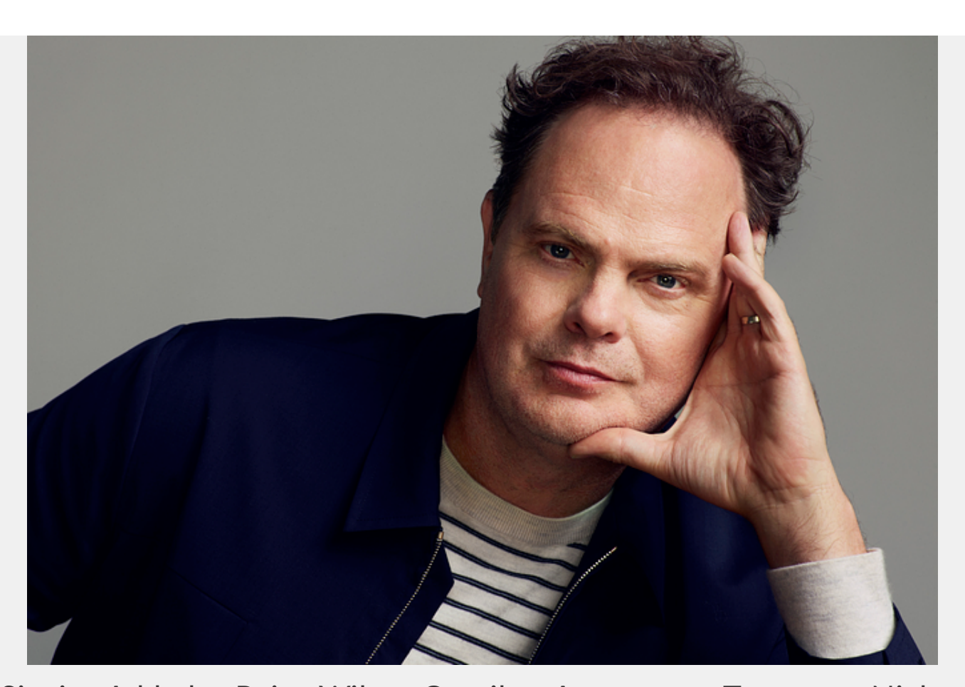
Book Signing Added to Rainn Wilson Omnibus Appearance Tomorrow Night

Students should schedule their appointment online through the Super Shot scheduling system by Sept. 27 using these step-by-step instructions . They are asked to bring a photo ID and health insurance card, if insured, with them on the day of the appointment. Because of a recent grant, Super Shot is offering the shots free of charge to students, regardless of their health insurance status.