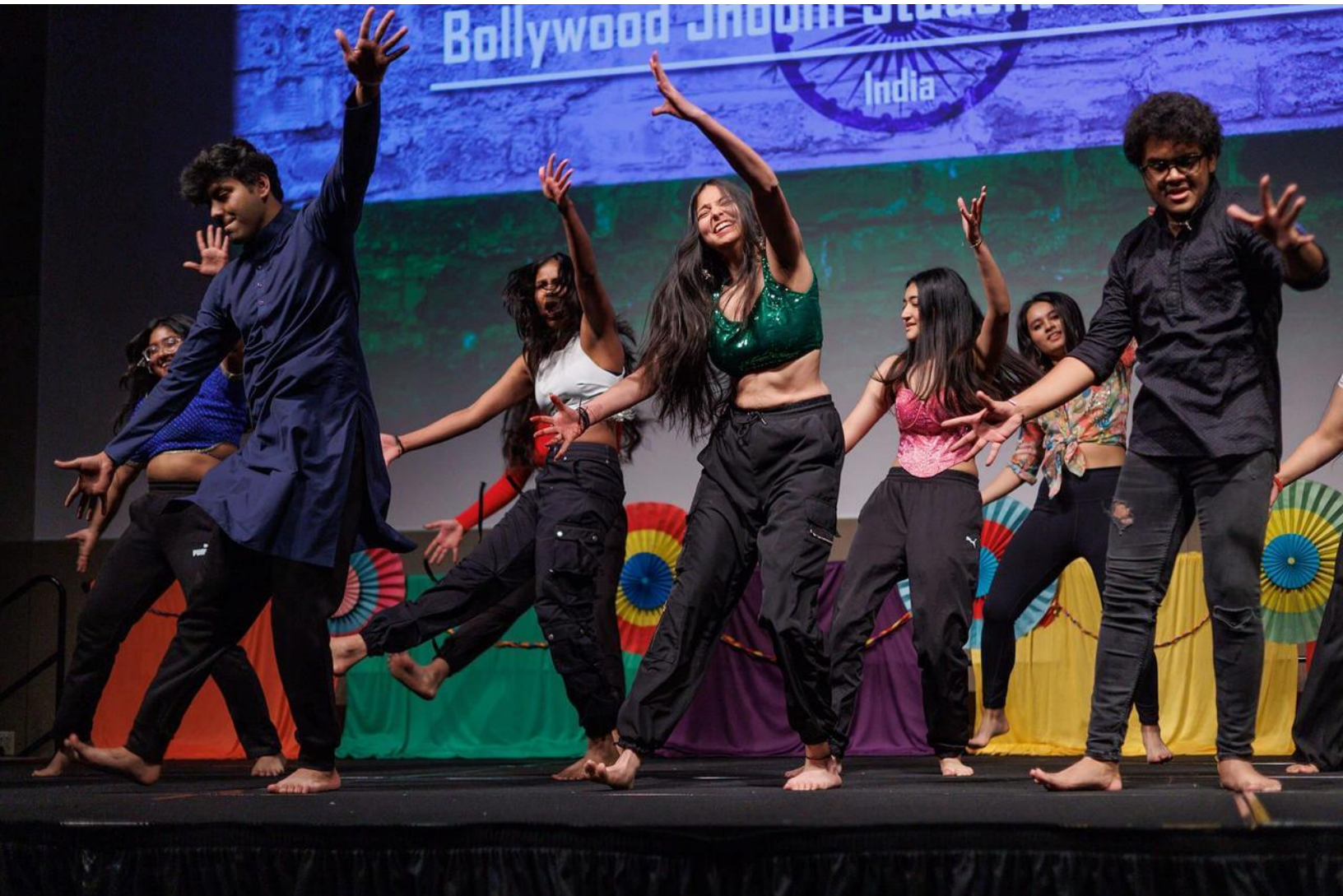
Students in the Bollywood Jhoom student organization performed during the Global Student Celebration on Friday.

Seen and noted around campus. Monitor our university social feeds for more great moments of Mastodon life.