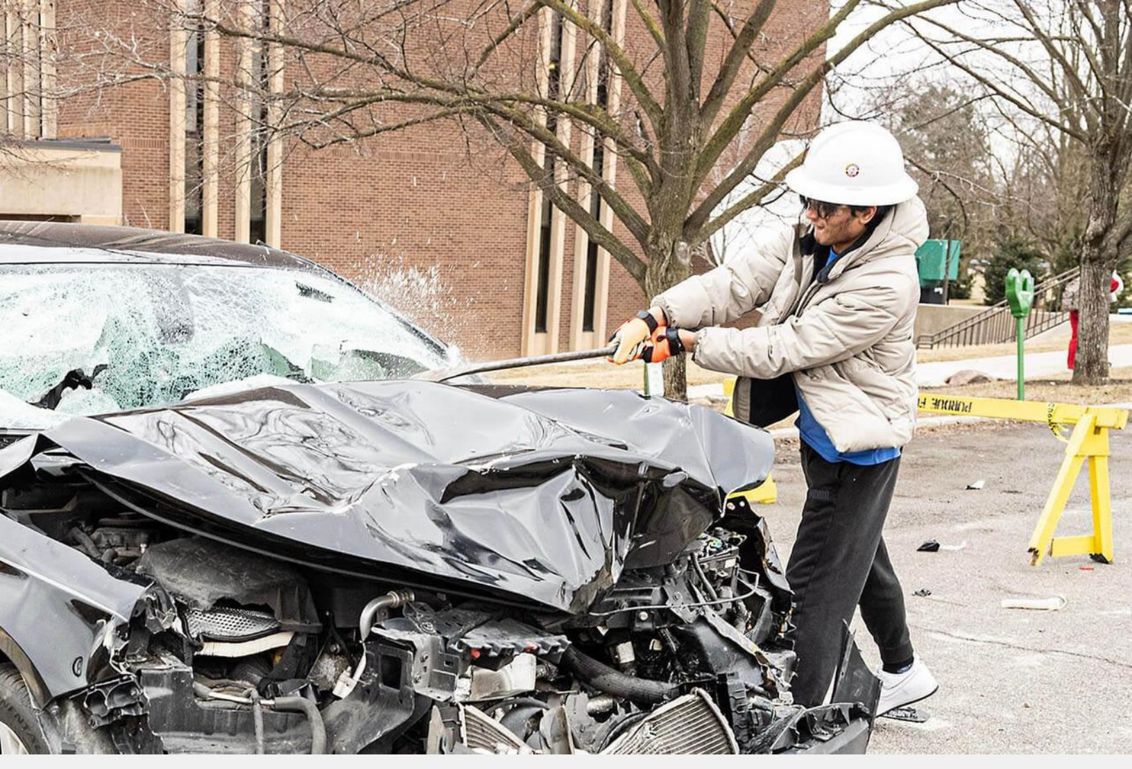
Passers-by could relieve stress last Thursday with the "Smash or Pass" car destruction event, held in Parking Lot 8 and sponsored by the Biology Club.