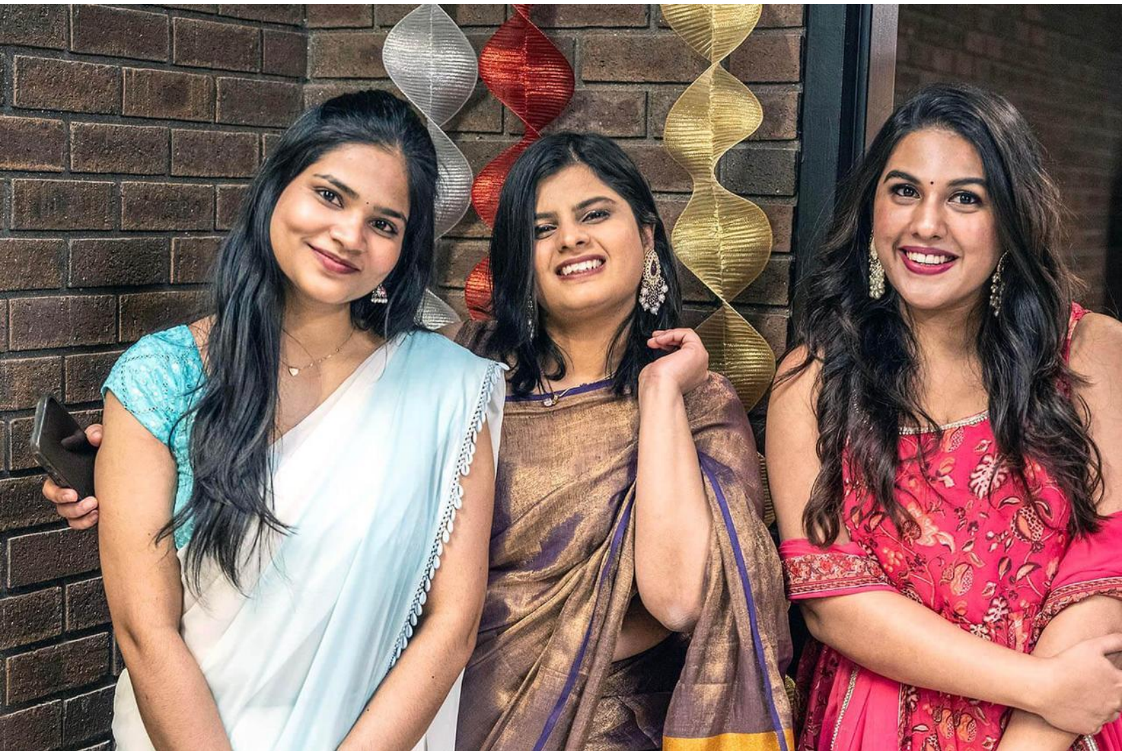
Students lined up as their favorite characters on Friday at the Indian Student Organization's Bollywood Night.

Seen and noted around campus. Monitor our university social feeds for more great moments of Mastodon life.