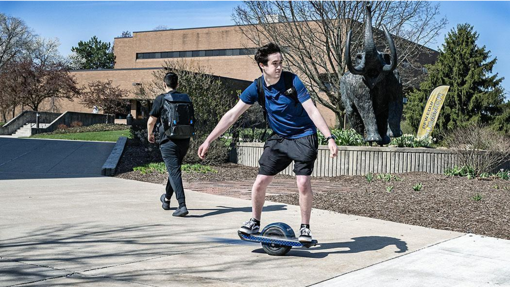
A student opted for alternative transportation on this beautiful April morning.

Seen and noted around campus. Monitor our university social feeds for more great moments of Mastodon life.