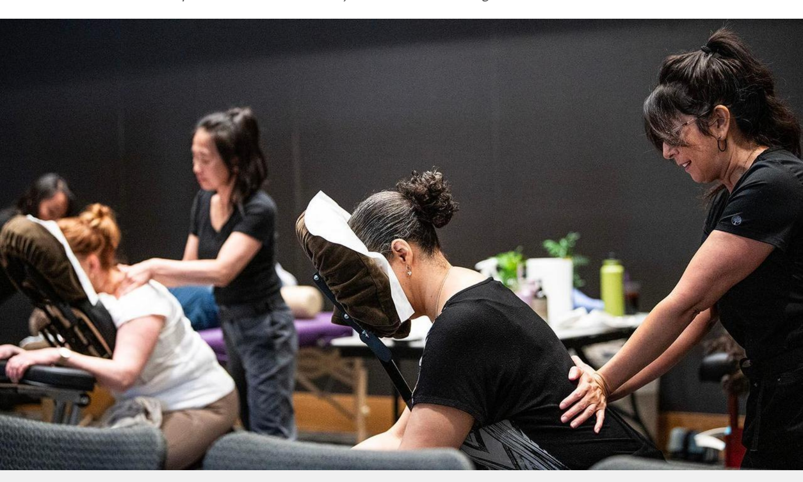
Relaxing chair massages were a popular feature at the annual Well-being Summit on March 28. More than 40 vendors provided health screenings, activities, mental health and self-care activities, and educational and informational resources in the International Ballroom at Walb Student Union.

Seen and noted around campus. Monitor our university social feeds for more great moments of Mastodon life.