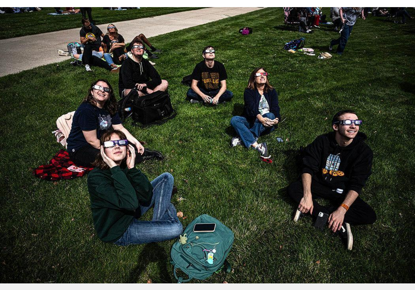
Around 3:10 p.m., the scene on the Science Mall looked a little like those old black and white photos of folks watching a 3D movie in the 1950s. Without question, the PFW campus was a popular place to gather and experience the wonder of Monday's near-total solar eclipse.

Seen and noted around campus. Monitor our university social feeds for more great moments of Mastodon life.