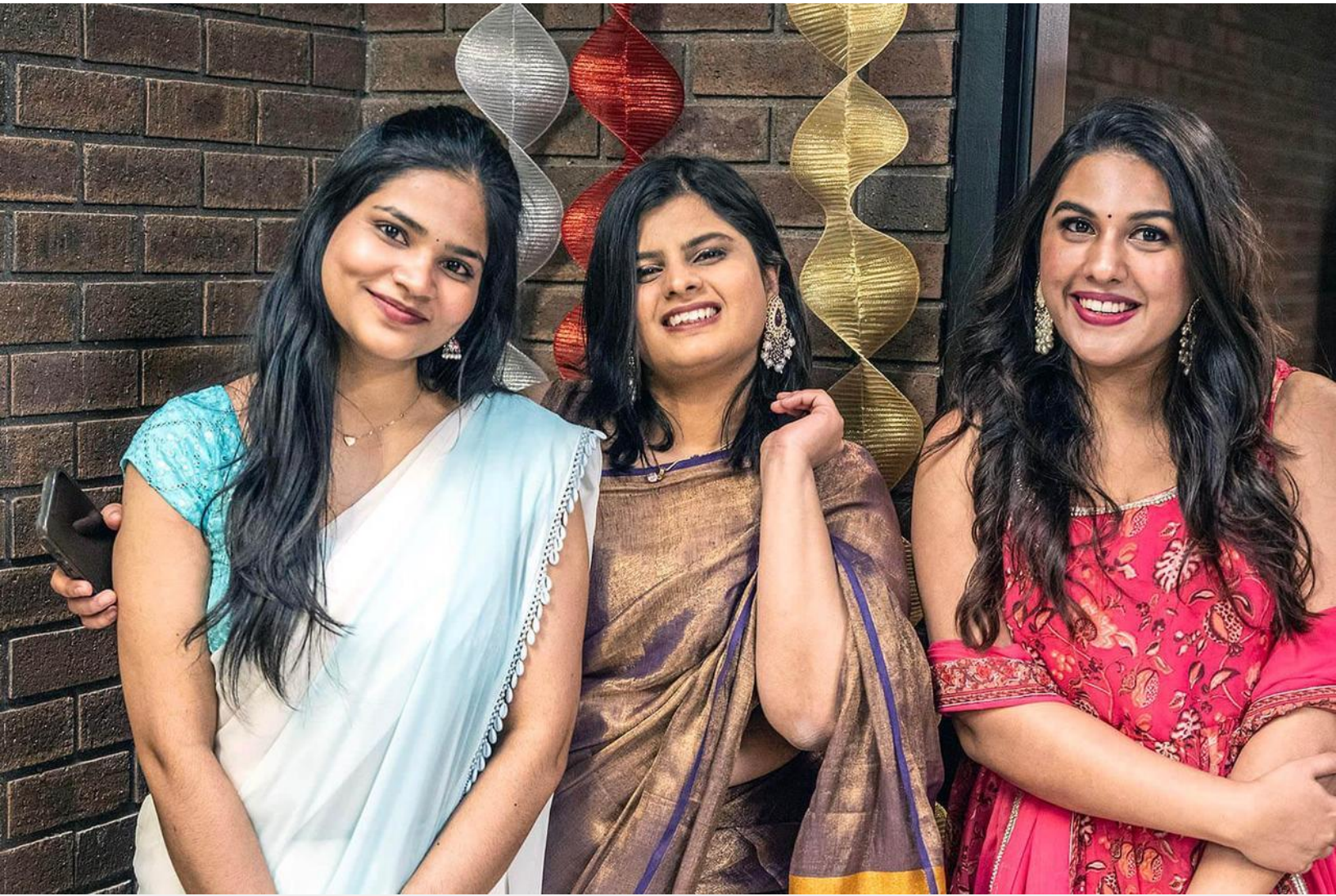
Students lined up as their favorite characters on Friday at the Indian Student Organization's Bollywood Night.

Seen and noted around campus. Monitor our university social feeds for more great moments of Mastodon life.