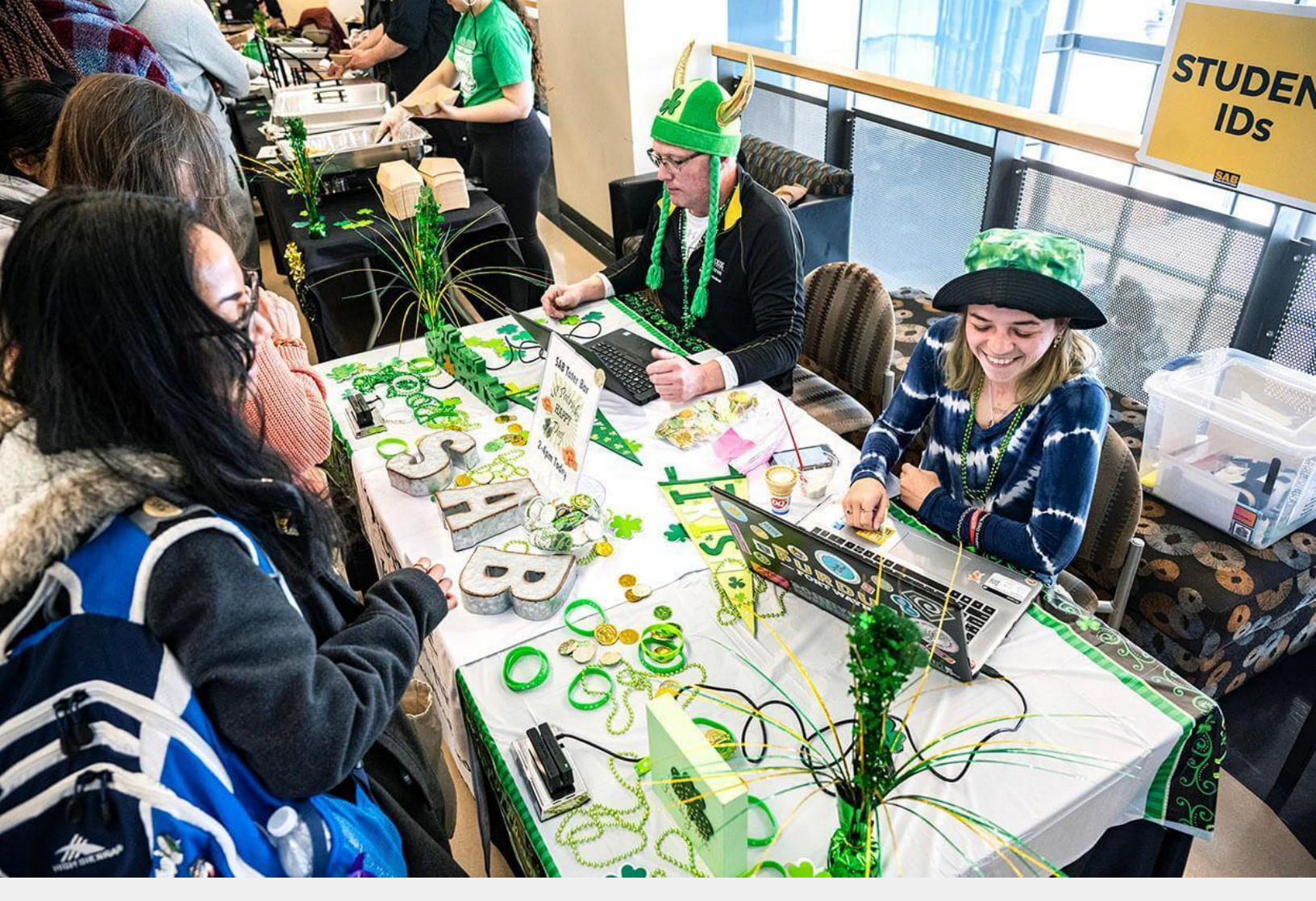
The festive Student Activities Board crew served up a potato bar on Tuesday as part of a belated St. Patrick's Day celebration.