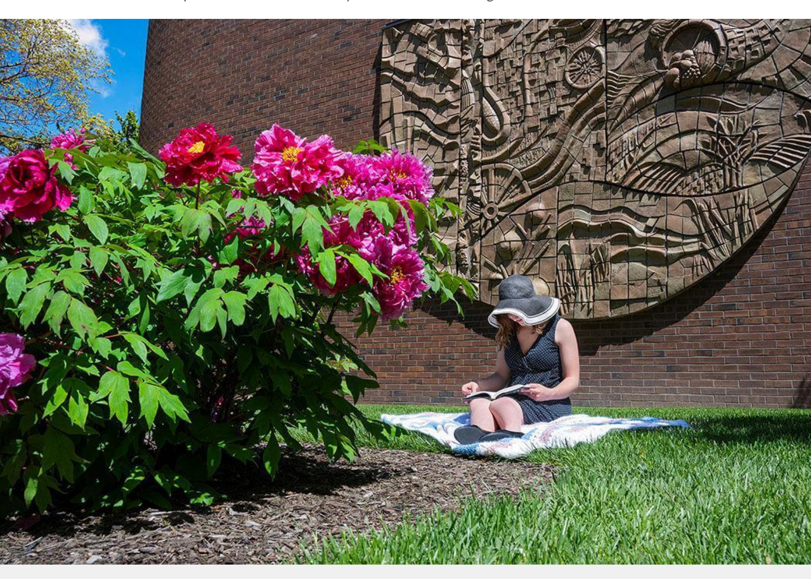
April 30 was a beautiful day to break out the sun hat during a finals week break. The peony bush pictured is in front of the Indiana Landscape sculpture on the south side of Neff Hall.

Seen and noted around campus. Monitor our university social feeds for more great moments of Mastodon life.