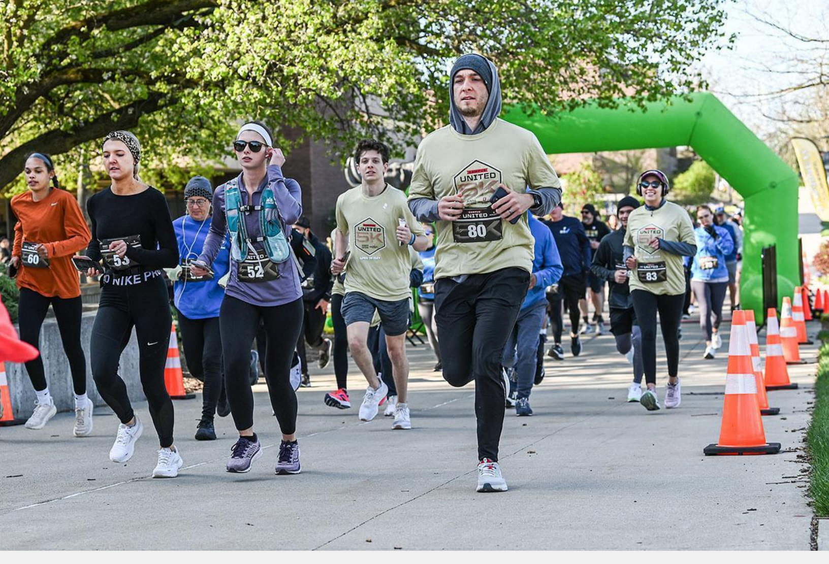
Participants from all around the community took part in the Campus United 5K Run/Walk through PFW's chilly spring scenery on Saturday morning. Proceeds from the annual event benefit The FRIENDS of the University Pantry.