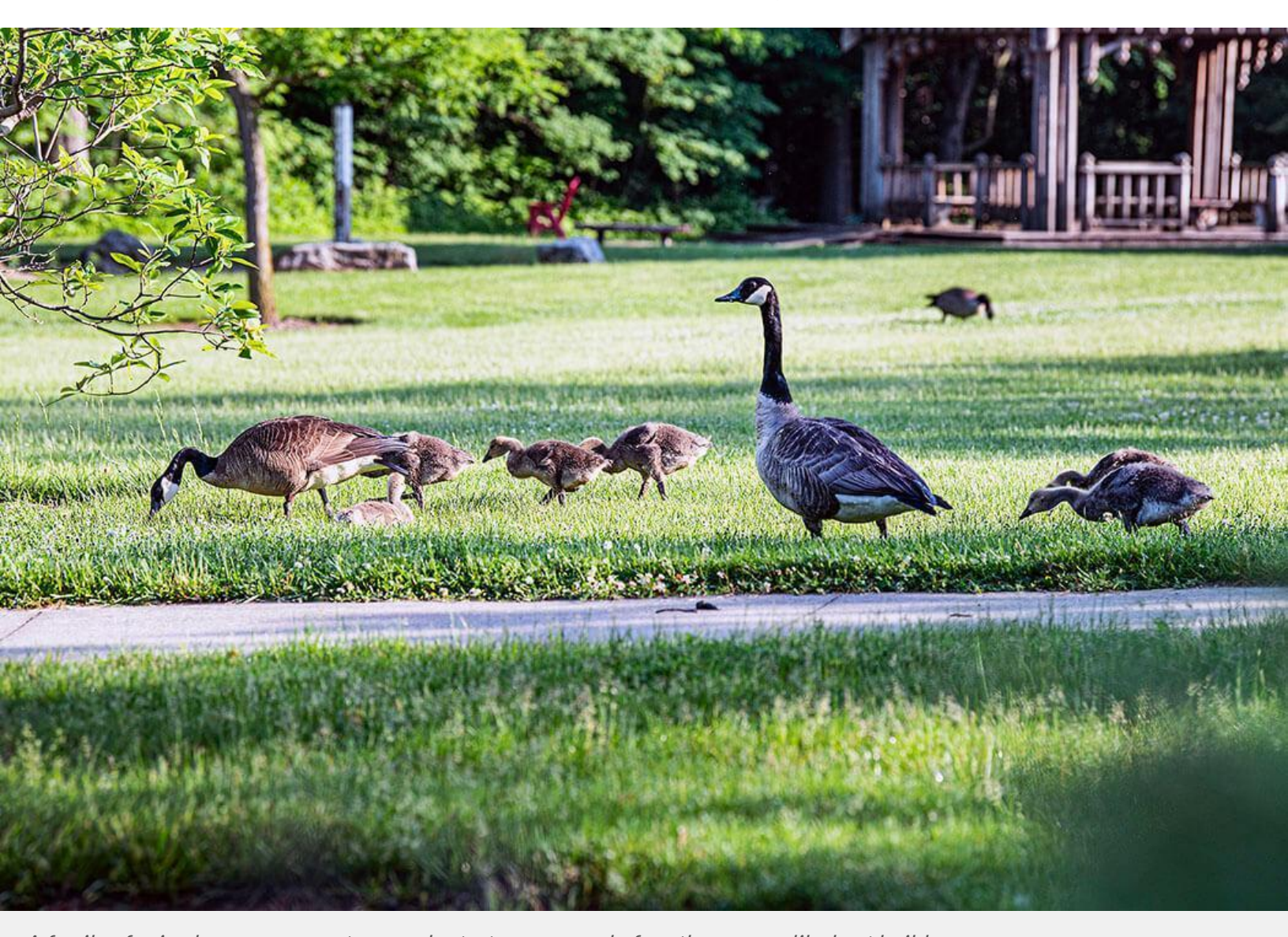
A family of avian lawnmowers gets an early start on campus before the summerlike heat builds.

Seen and noted around campus. Monitor our university social feeds for more great moments of Mastodon life.