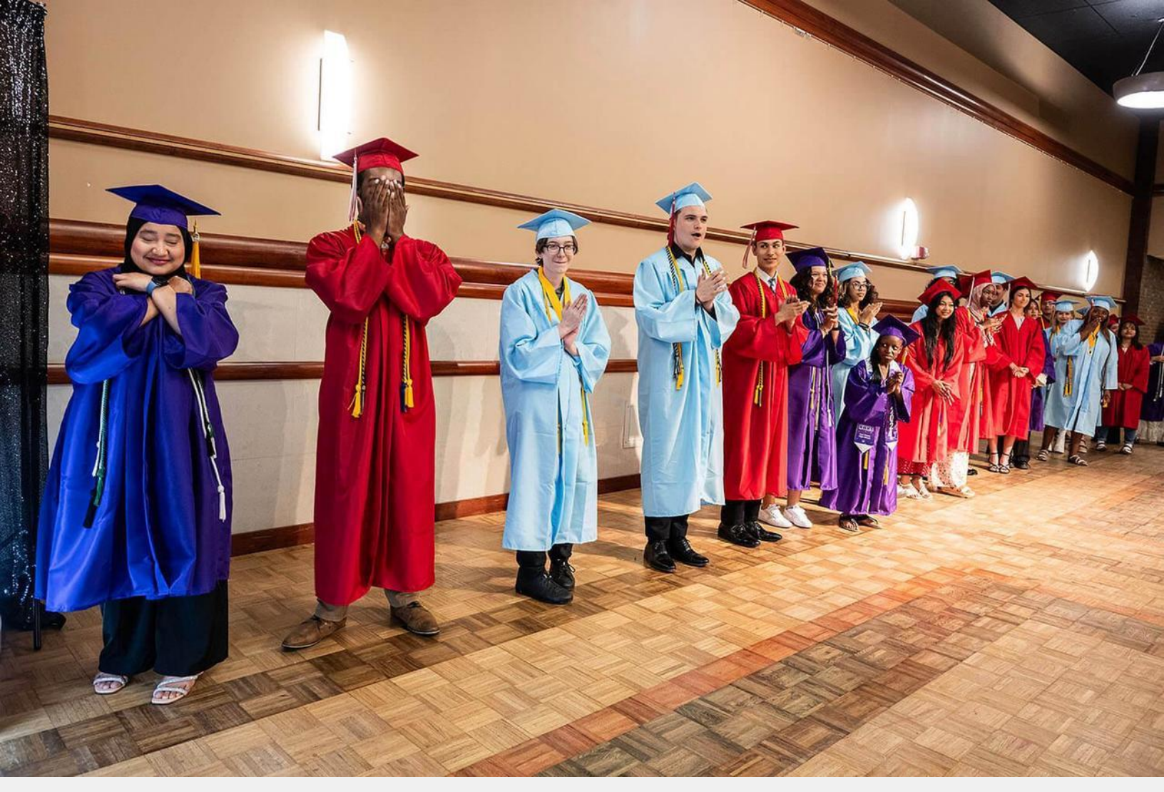
Accomplished high school seniors participating in PFW's TRIO and Upward Bound programs were recognized in the Classic Ballroom at Walb Student Union on May 22 with stoles and certificates, as well as special awards.