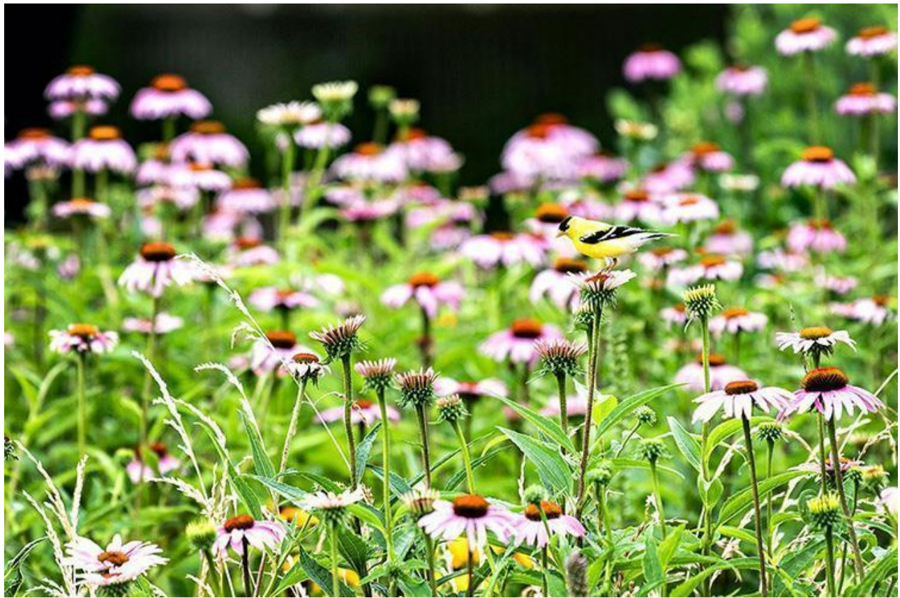
A hungry goldfinch perches within a sea of coneflowers in Alumni Plaza.