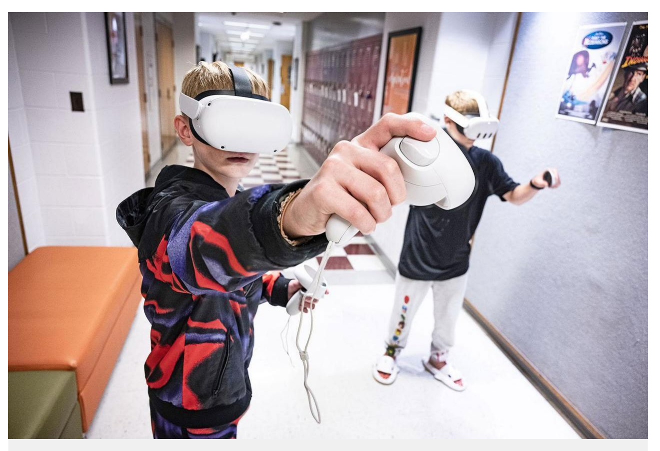
Middle school students at Virtual Reality Camp worked on their VR skills last week—one of several summer programs offered by the VPA Community Arts Academy.