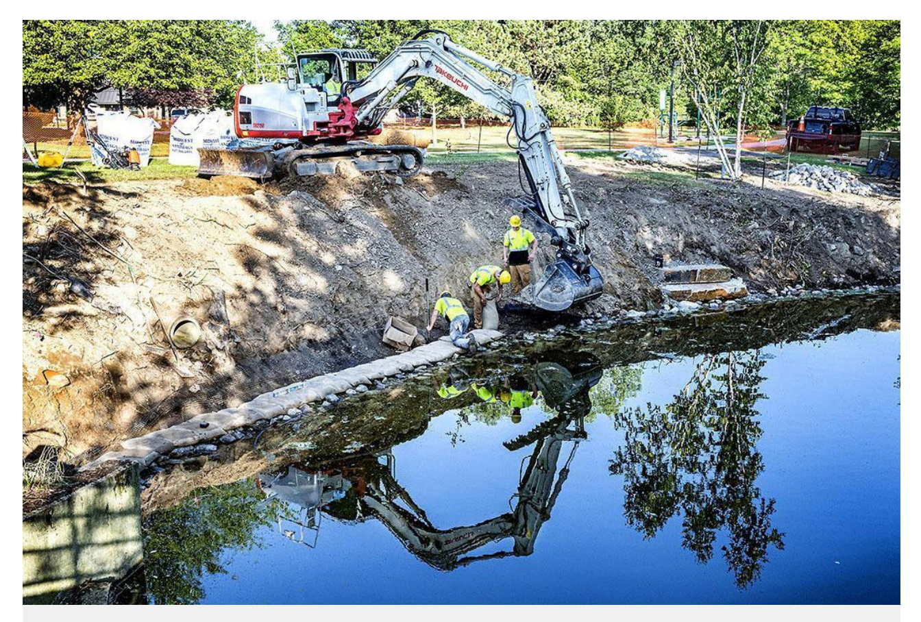
A crew is currently working on the stream outlet near Alumni Plaza. The project is intended to stabilize the bank of the St. Joseph River to prevent erosion, while looking attractive.

News Center Inside PFW Archive Athletics