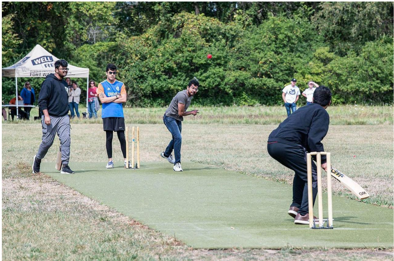
The first Fall Cricket Fest was held on the new pitch across Venderly Bridge on Friday. The multiday tournament, sponsored by International Education and WellRec, will also be held the next two Fridays.