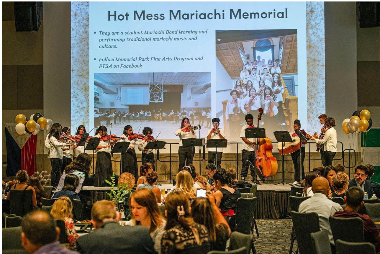
The "Hot Mess" Mariachi Band from Memorial Park Middle School performed at the Multilingual Northeast Indiana Gala in the International Ballroom at Walb Student Union on Saturday. The gala's purpose was to shine a spotlight on the impact educators make in the lives of their students and in fostering the growth of northeast Indiana. The event was presented by the Teaching English as a New Language program and the Three Rivers Language Center in the School of Education.