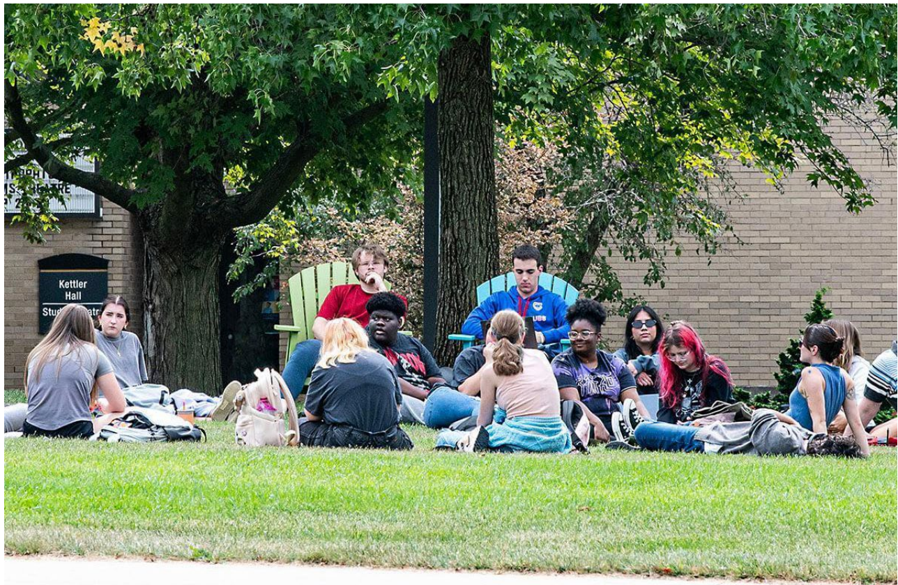
Wednesday's beautiful weather provided a perfect opportunity to move a class from Kettler Hall to the great outdoors.