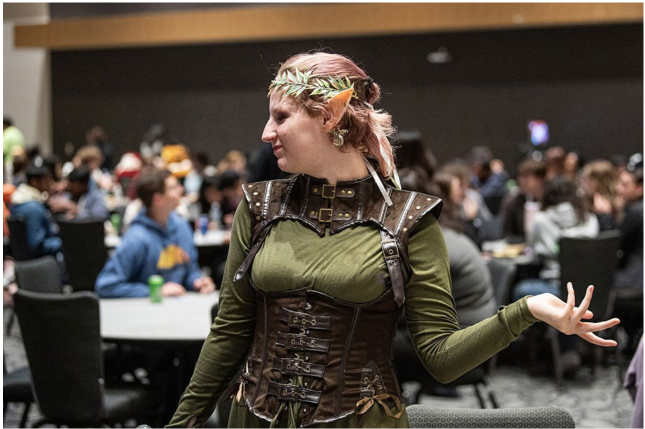
An Elvish maiden prepared for adventure at Student Life Bingo: Trick or Treat on Oct. 16. Along with prizes, there was food—including plenty of candy—and a costume contest.