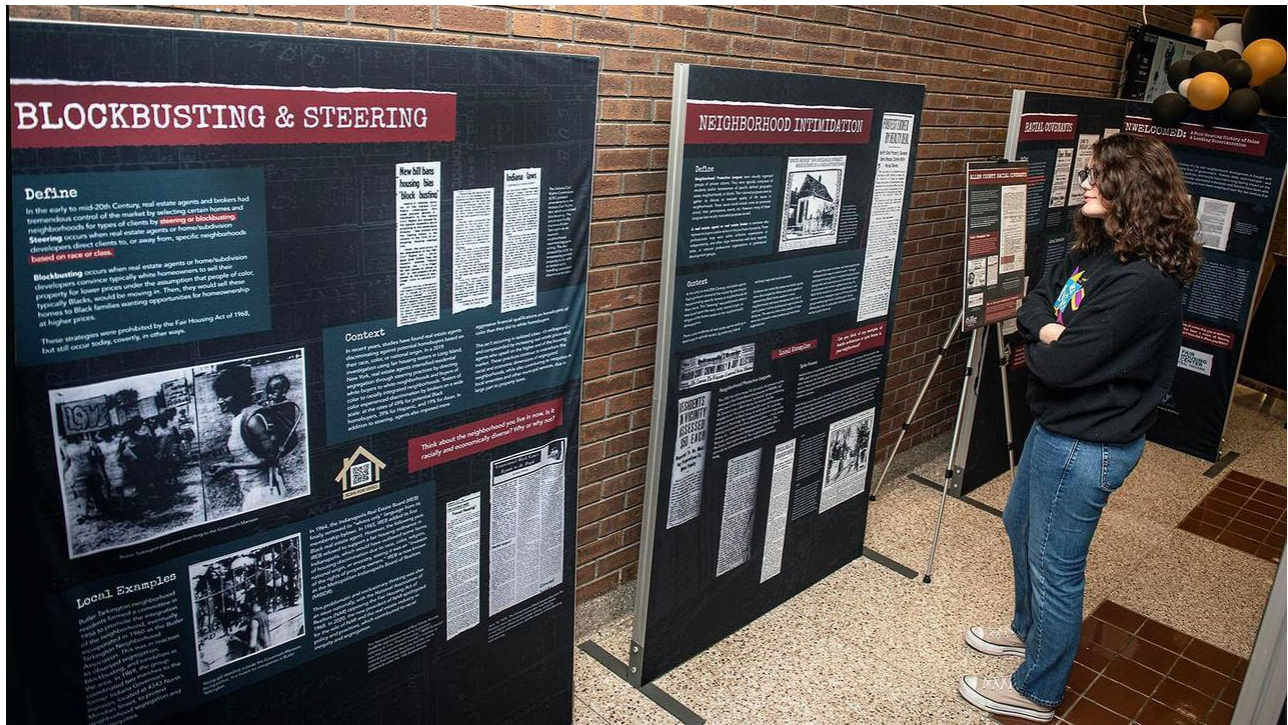
"Unwelcomed: A Fair Housing History of Sales and Lending Discrimination" is on display near the Multicultural Center in Walb Student Union. The educational exhibit, sponsored by the center and the Fair Housing Center of Central Indiana, will be displayed until Nov. 25.