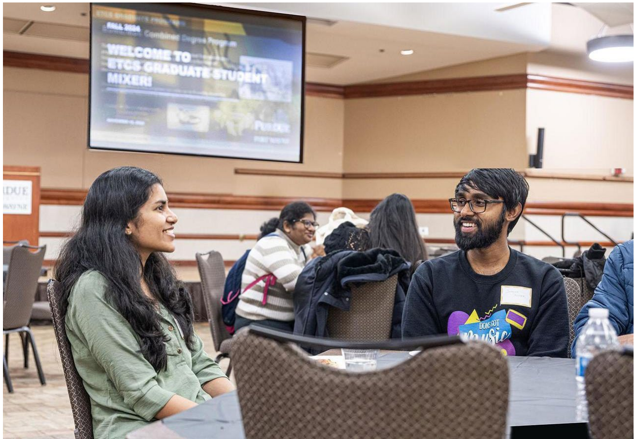
Graduate students in the College of Engineering, Technology, and Computer Science got to mingle over pizza with faculty and other members of the university community on Monday at the ETCS Graduate Student Mixer.