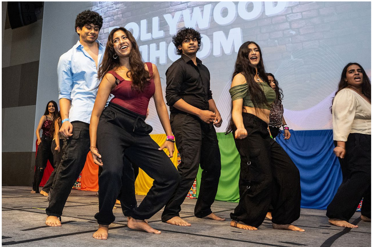
The Indian dancing of Bollywood Jhoom was one of the many lively performances from PFW's talented international students at the annual Global Student Celebration on Friday.