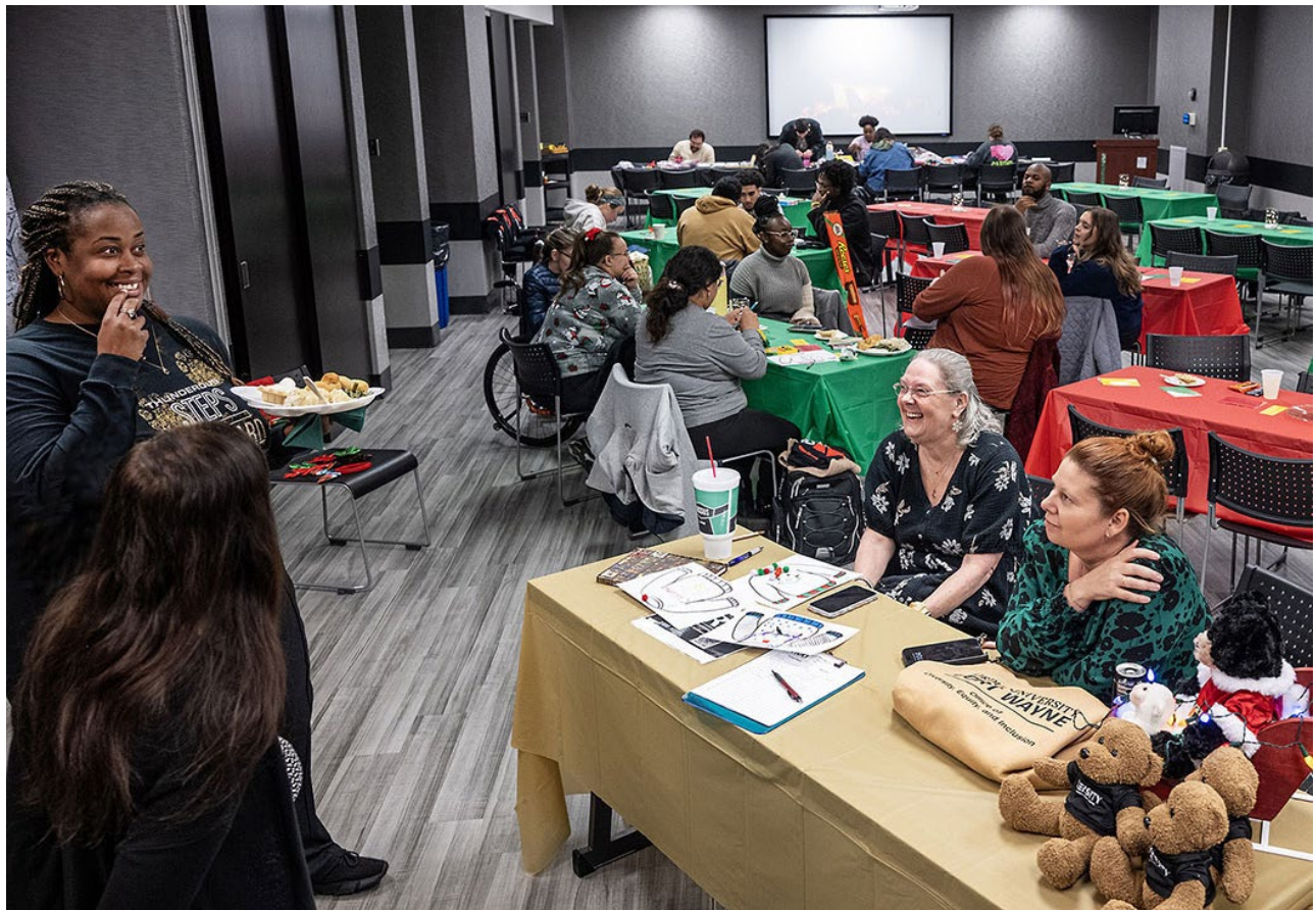
Holiday food, games, crafts, and pleasant conversation were featured Monday during a TRIO holiday event at Walb Student Union.