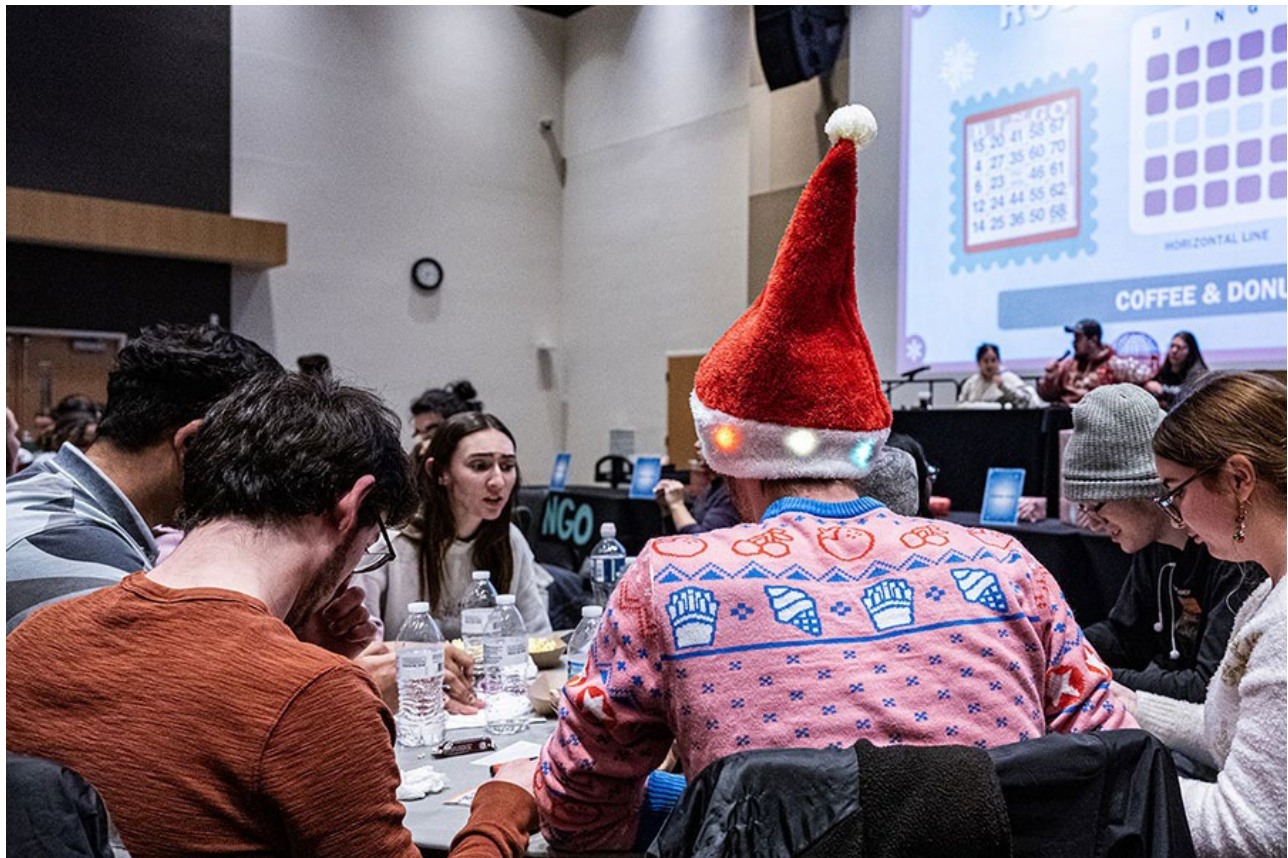
A full house of students anxiously vied for prizes on Dec. 11 at the annual Student Activities Board and Student Life Holiday Bingo Blowout, PFW's biggest bingo event of the year.