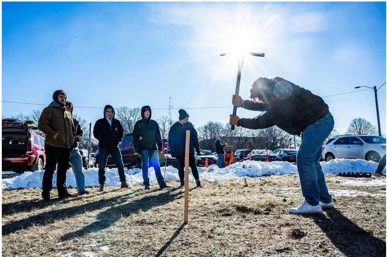
Civil engineering students in CE381 tackled the frozen earth on Monday near the St. Joseph River in a hands-on soil exploration lab. Pickaxes were first used to establish a location, then other equipment was brought in to obtain a soil sample. The collected material will be used to carry out experiments to explore concepts in construction.