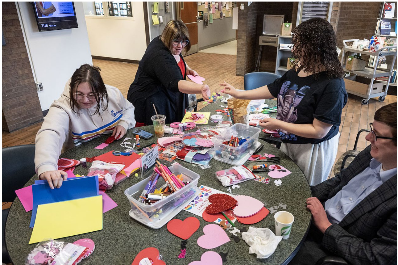
Students and staff gathered in the Liberal Arts Building lobby on Tuesday for a CoLA-sponsored valentine crafting session, complete with cookies and cocoa. Events are being held daily for "Love Liberal Arts Week."