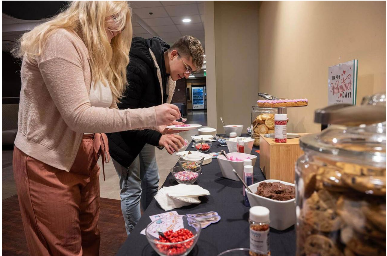
Fresh Ideas spread the love on Valentine's Day with a cookie-decorating station in Don's at Walb.

Seen and noted around campus. Monitor our university social feeds for more great moments of Mastodon life.